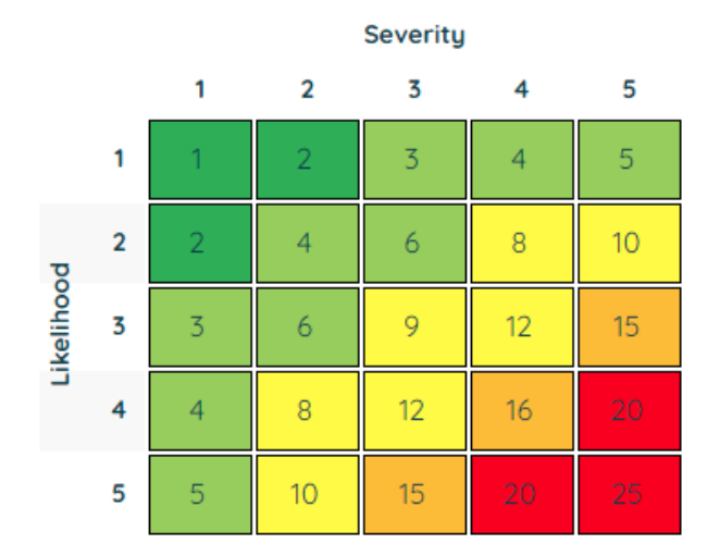
Risk when control measures are applied